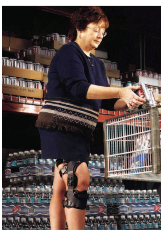
a correct match for the patient The market for OA braces is growing at more than 10

If your patient's quality of life hinges on an OA product, look to DonJoy for your bracing solution. To review DonJoy's complete line of OA bracing, visit their Web site at www.donjoy/arthritis.com.